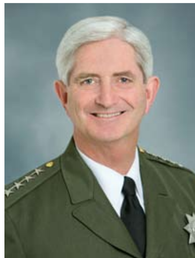
Sheriff Bill Gore

San Diego Sheriff Bill Gore heads a force of more than 4,000 persons who work daily to curb border violence while conducting their traditional policing operations of our County's 4,200 square miles.